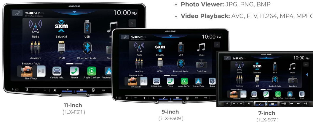
11-inch ( iLX-F511 )